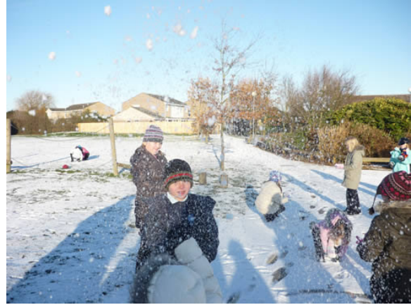
The perfect weather to start our winter topic!!