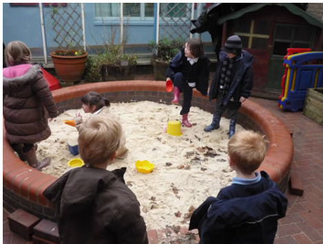
Life in the sandpit

Dear Reception Parents, a warm welcome back to a cold Spring Term! The children have now been in for two weeks and have found their stride quickly, enjoying our new topic of Light and Dark, especially keeping a keen eye out in the lighthouse! The children are also enjoying our new outdoor areas, with digging areas, water play and a sand pit big enough to lose some children in (!), we are all eager to show this off to all parents and carers, and hopefully will be having a grand opening sometime nearer half term, when we've had a chance to decorate it and the people with the plants have been in. More info to come! Finally, a few notes- please can you ensure your child has their P.E. kit in school, and also if there are any parents out there with old spare clothes that don't fit their own children anymore, but may fit our Reception children, then please could we have those, as we are starting to run a bit low. Also if you have a pair of wellies that you don't mind leaving in school for your child, so they can play in the sand pit without getting their shoes completely covered, both children and teachers would appreciate that! Lastly, some parents have enquired about possibly coming in and helping out for a morning or so, and you would be very welcome indeed. We will organise a parent help rota for you to sign up to in the near future. Many thanks, the Foundation Stage Team.