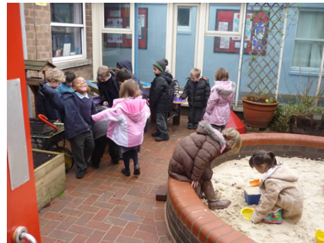
Learning with water