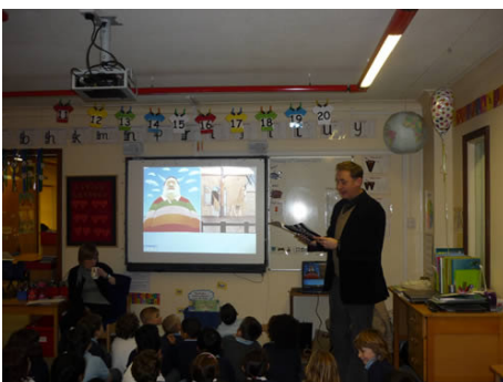
Favourite stories shared