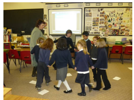
KS1 learning Spanish (in Golden Morning)